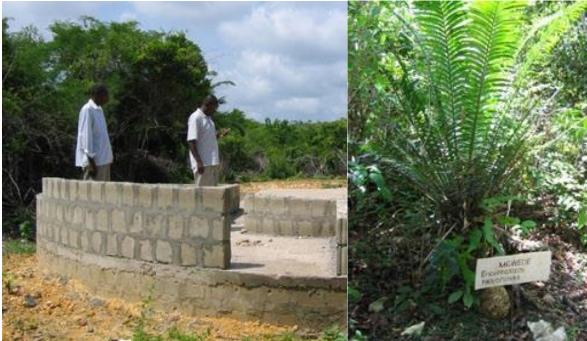
The constructions of the information center (left) and plant from the nature trail (right).