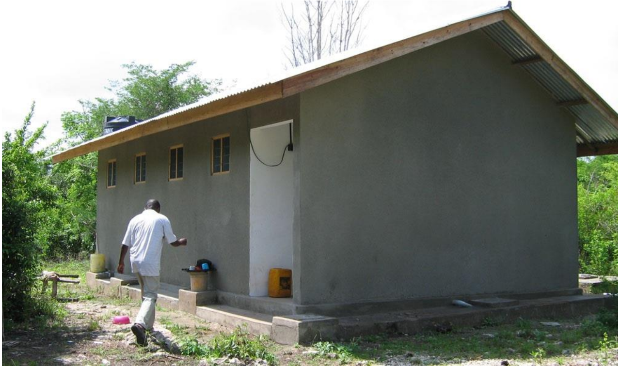
The service building.