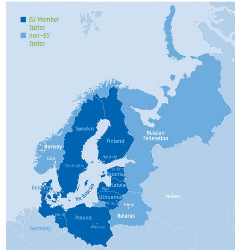
Baltic Sea Region Programme area 2007 - 2013