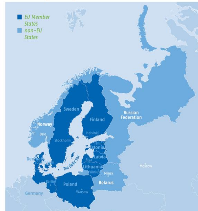
Baltic Sea Region Programme area 2007 - 2013