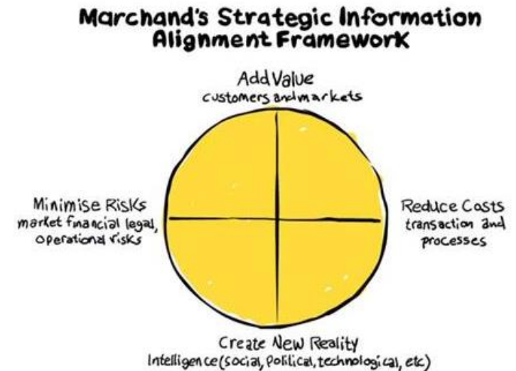
Management Operating System video featuring a visual framework