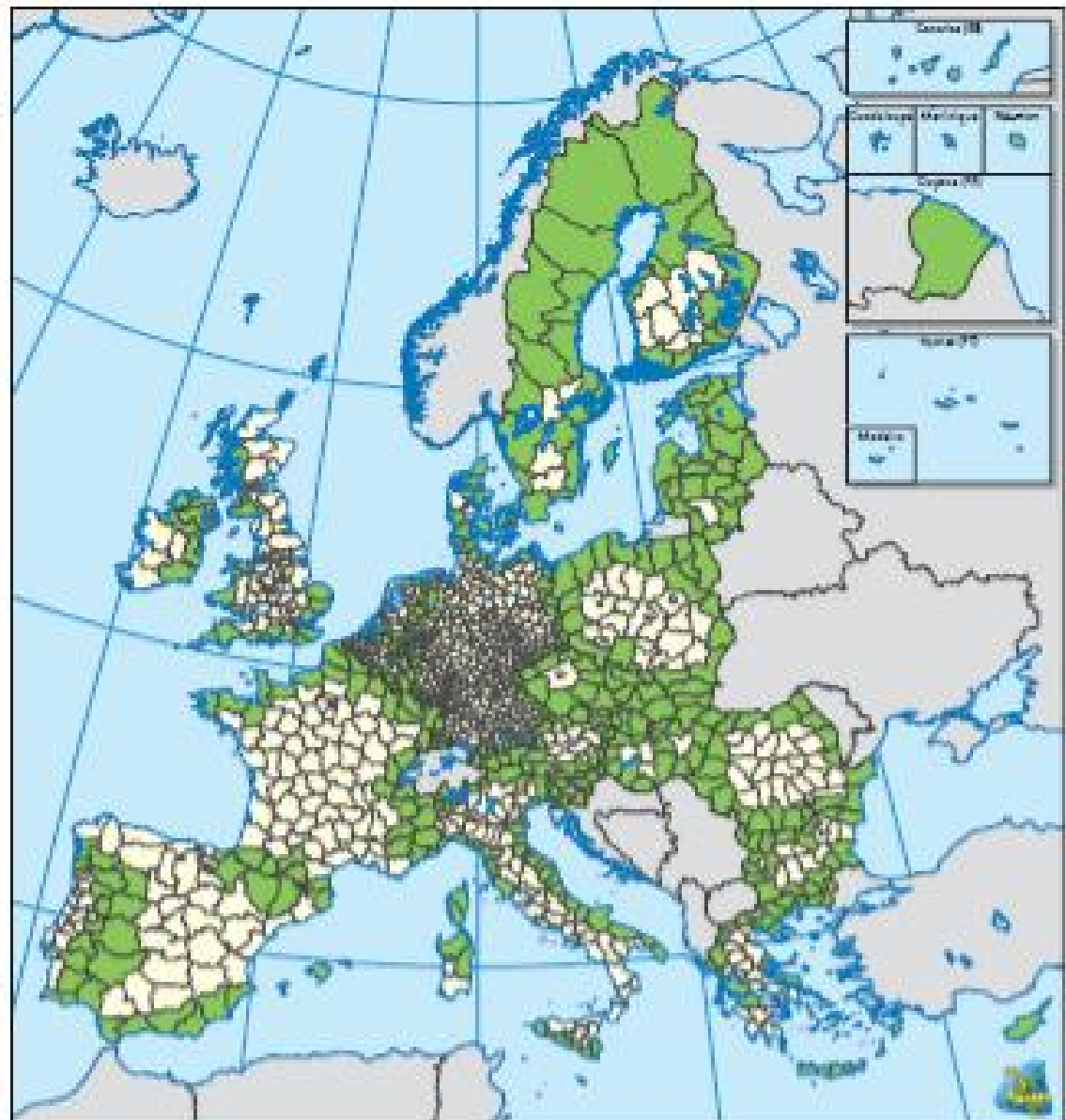
Areas for Crossborder Cooperation 2007-2013